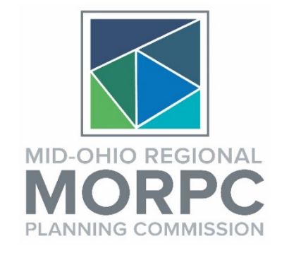
2021 Sustainability Advisory Committee