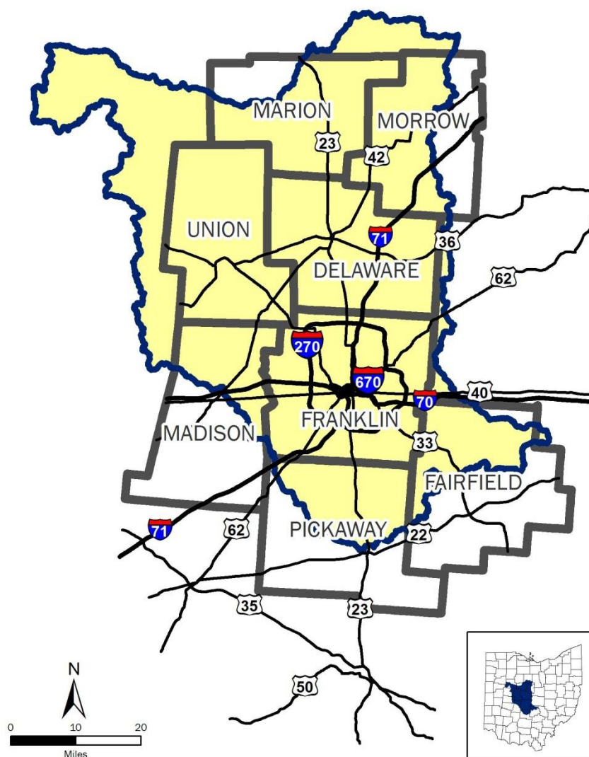
Figure 1-1. Map of the Sustaining Scioto project area