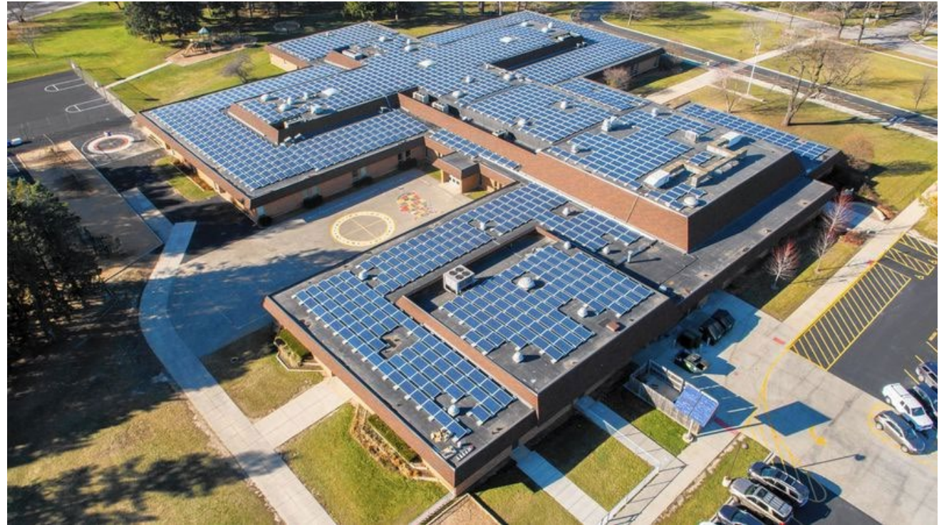
Butterfield Elementary, Libertyville School District | near Chicago, IL