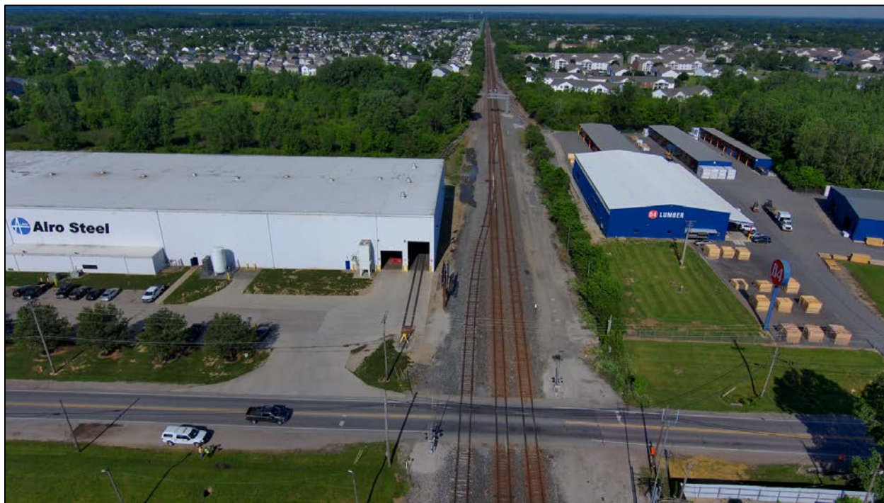
I.4 - Aerial view of existing at-grade crossing (513244C) looking west.