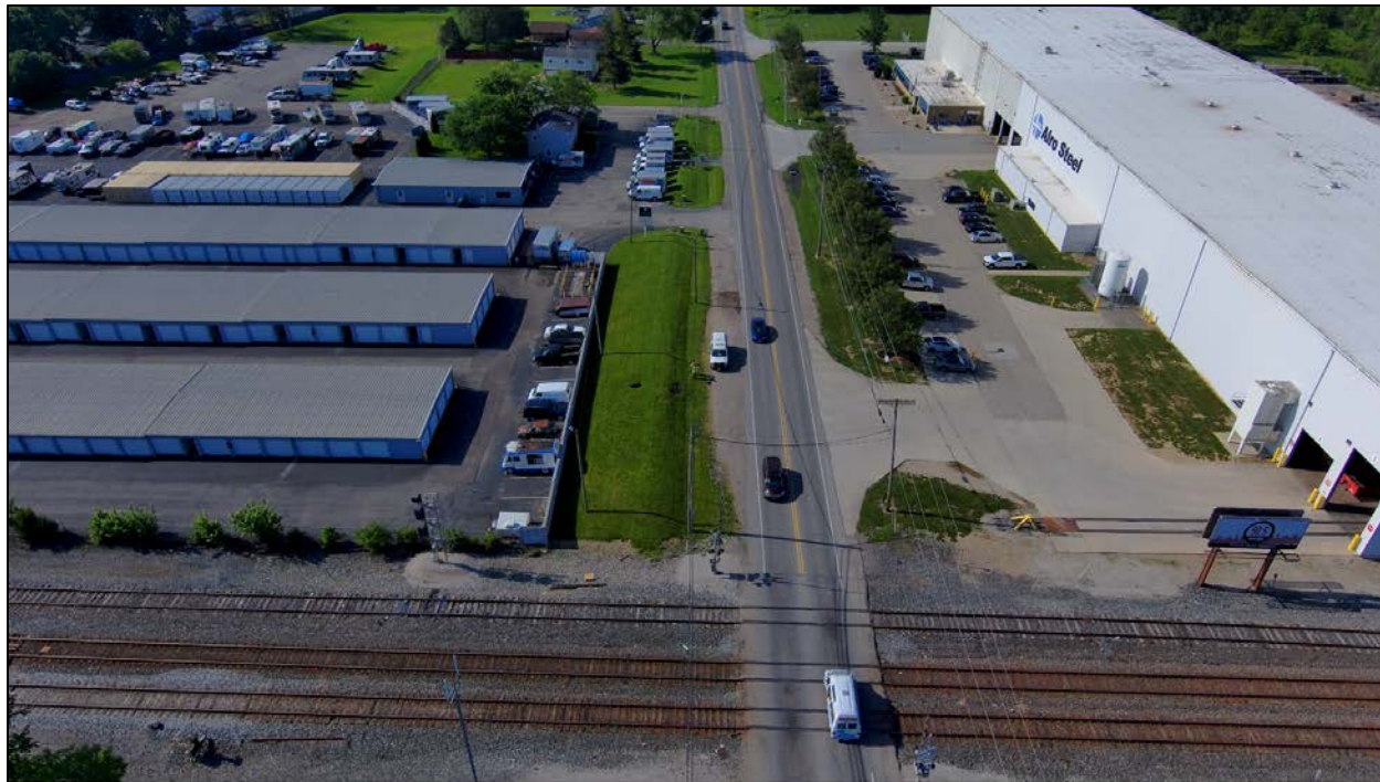
I.3 - Aerial view of existing at-grade crossing (513244C) looking south.