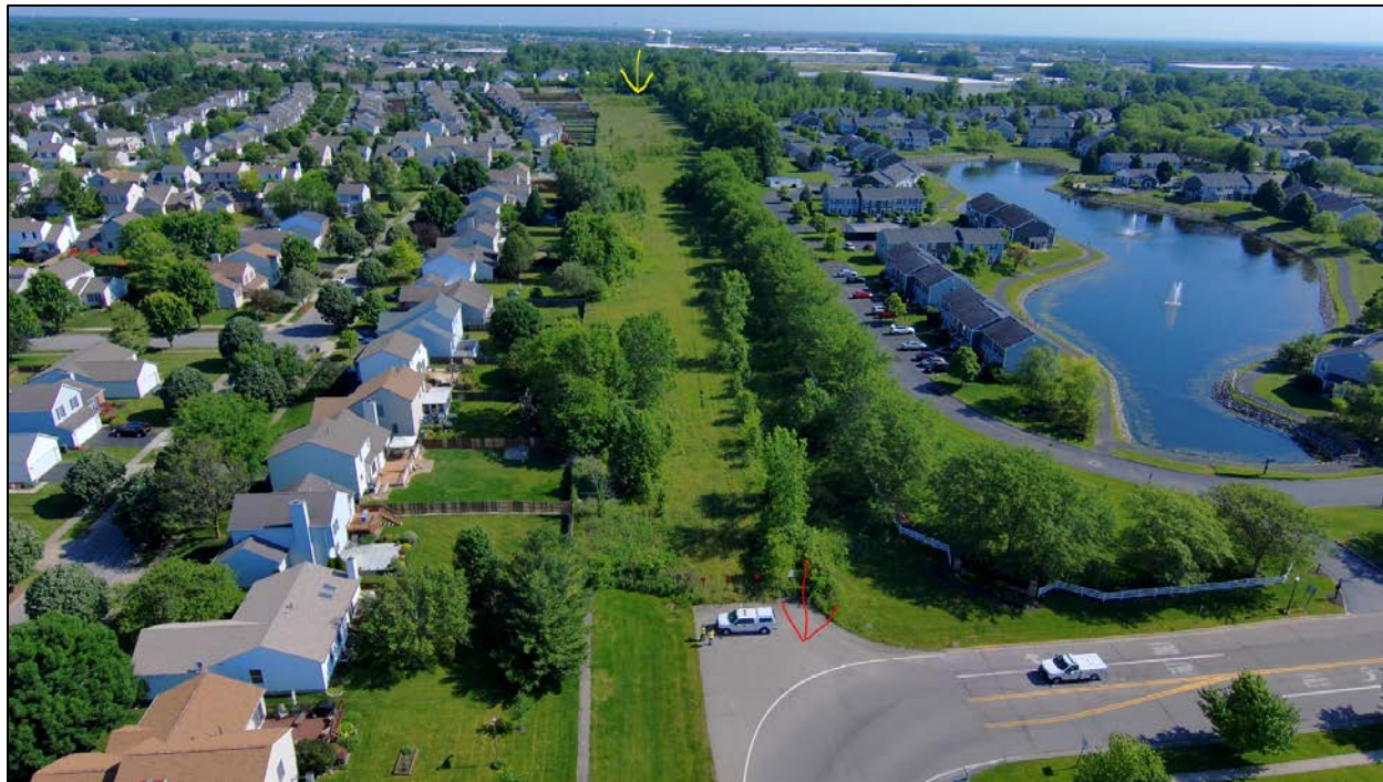
II.3 - Aerial view of looking north from Galloway Road's current terminus (red arrow) towards approximate area (yellow arrow) roadway bridge would pass over railroad corridor.