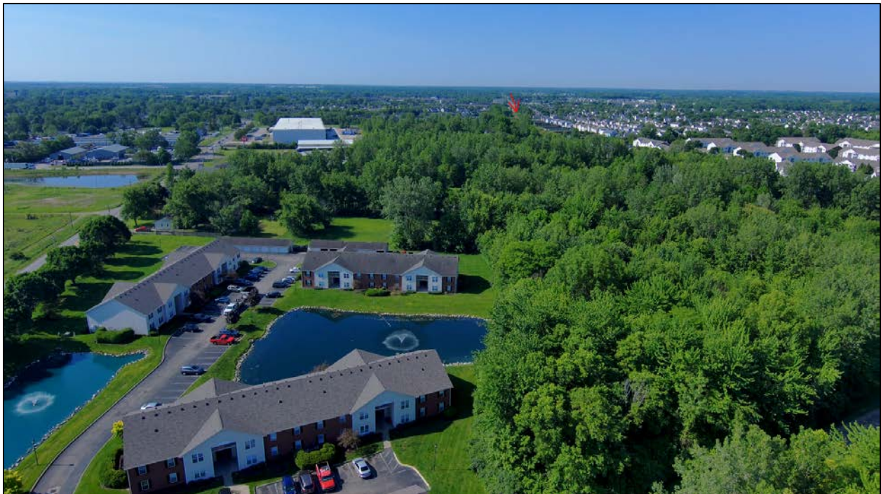
II.1 - Aerial view of looking south from Summerlin Way towards Galloway Road's current terminus (red arrow). The proposed roadway extension and separated crossing would start from the arrow and extend towards the bottom right of the picture.