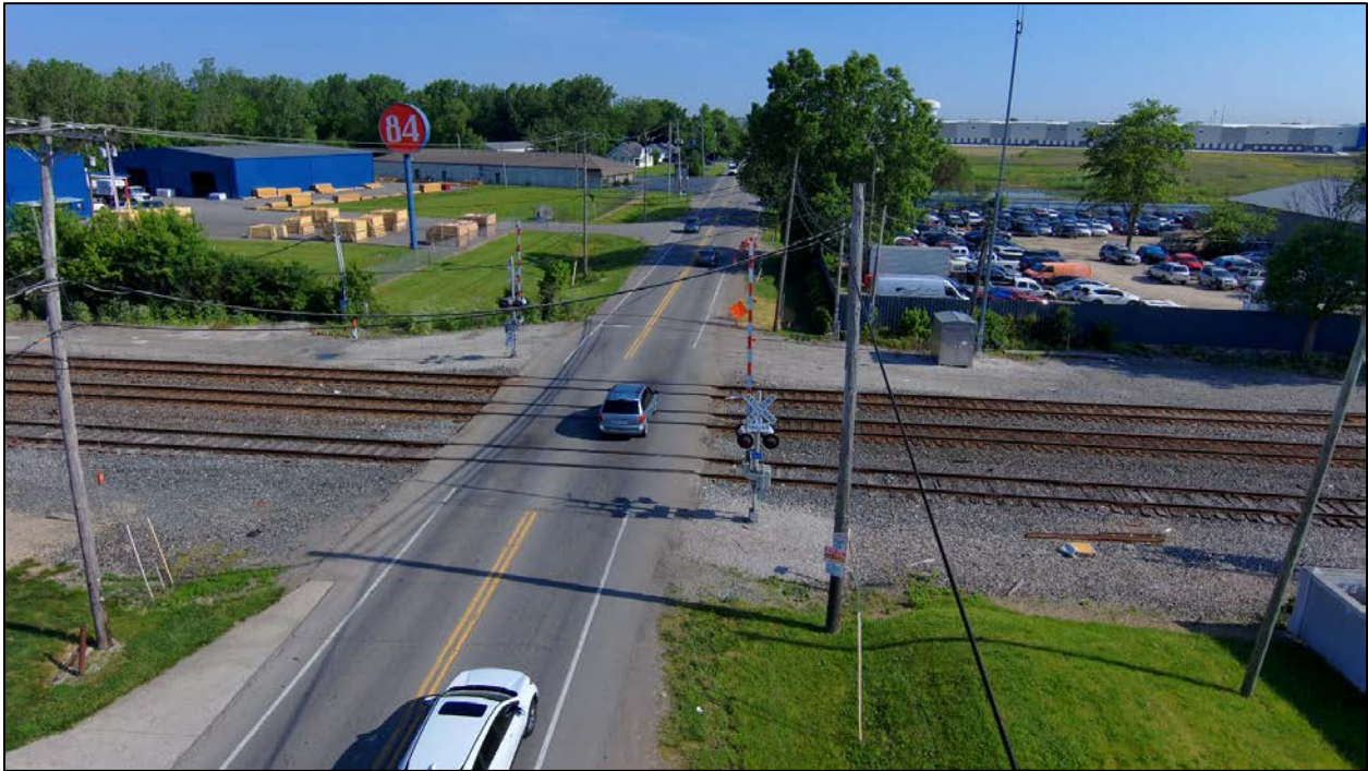
I.1 - Aerial view of existing at-grade crossing (513244C) looking north.