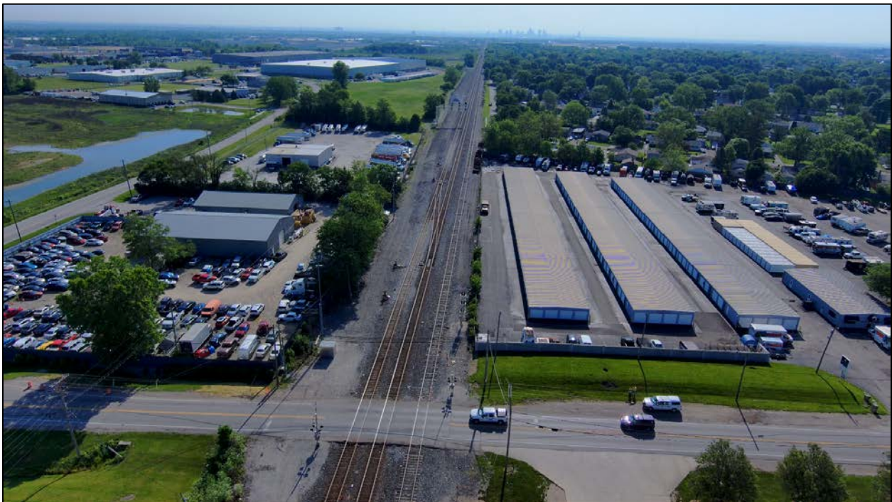
I.2 - Aerial view of existing at-grade crossing (513244C) looking east.