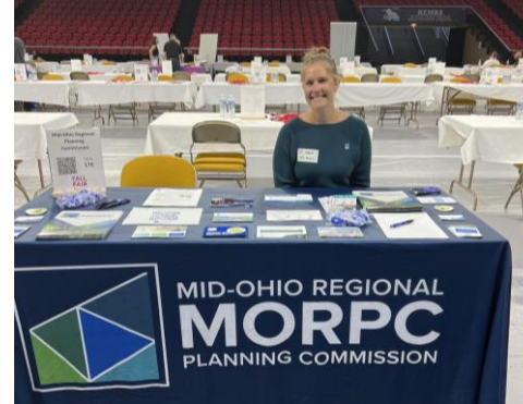
Miami University Fall Career Fair September 18