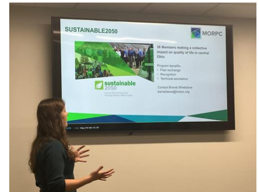
OSU City & Regional Planning Info Session October 7