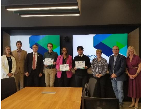
Easton Future Vision Fellows Competition August 13