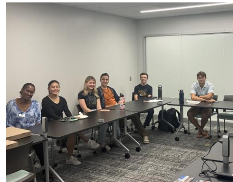
OU Fall Career Fair & Info Session October 2