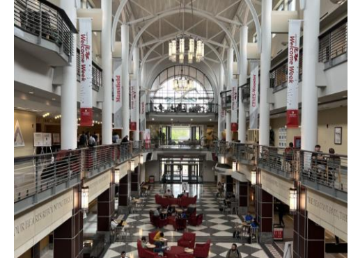
OSU Engineering Fall Career Fair September 25