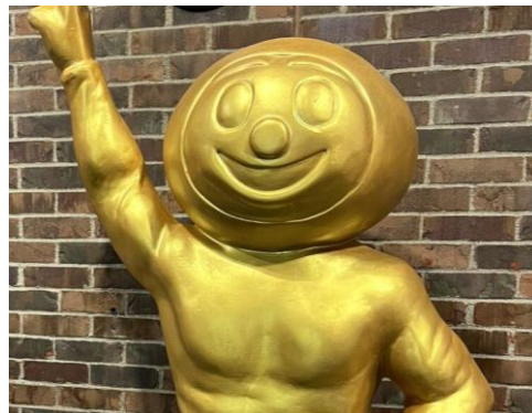
OSU Environmental Sciences Fall Career Fair September 26