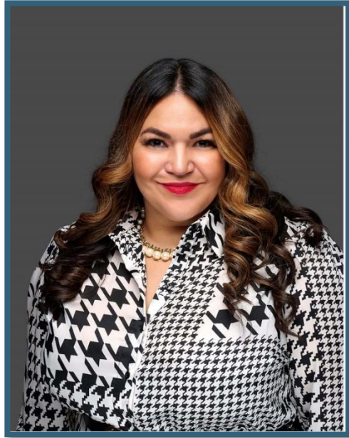
COUNCILMEMBER LOURDES BARROSO de PADILLA CHAIR, REGIONAL POLICY ROUNDTABLE