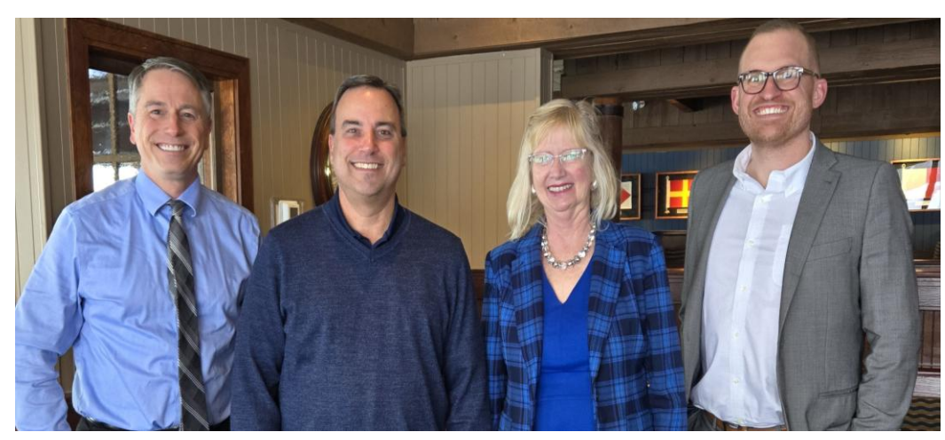
CITIES: City of Heath City of Grandview Heights