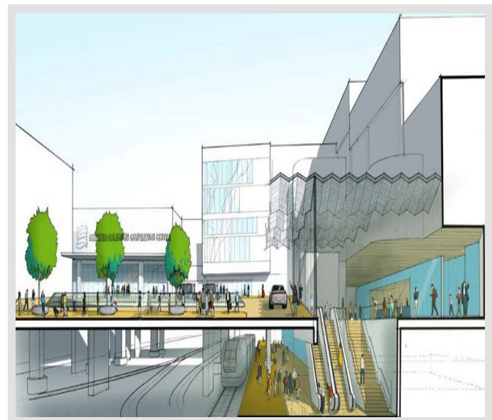
A conceptual image of what a downtown passenger rail station could look like in Columbus.